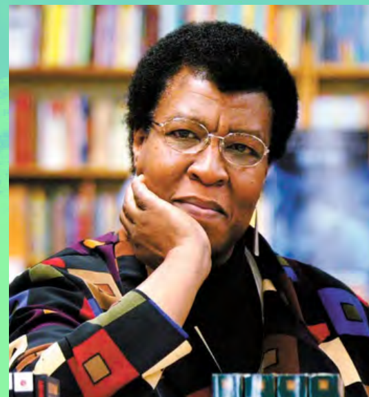
Octavia E. Butler